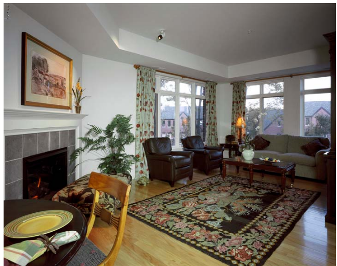
Woodbridge A Unit Model